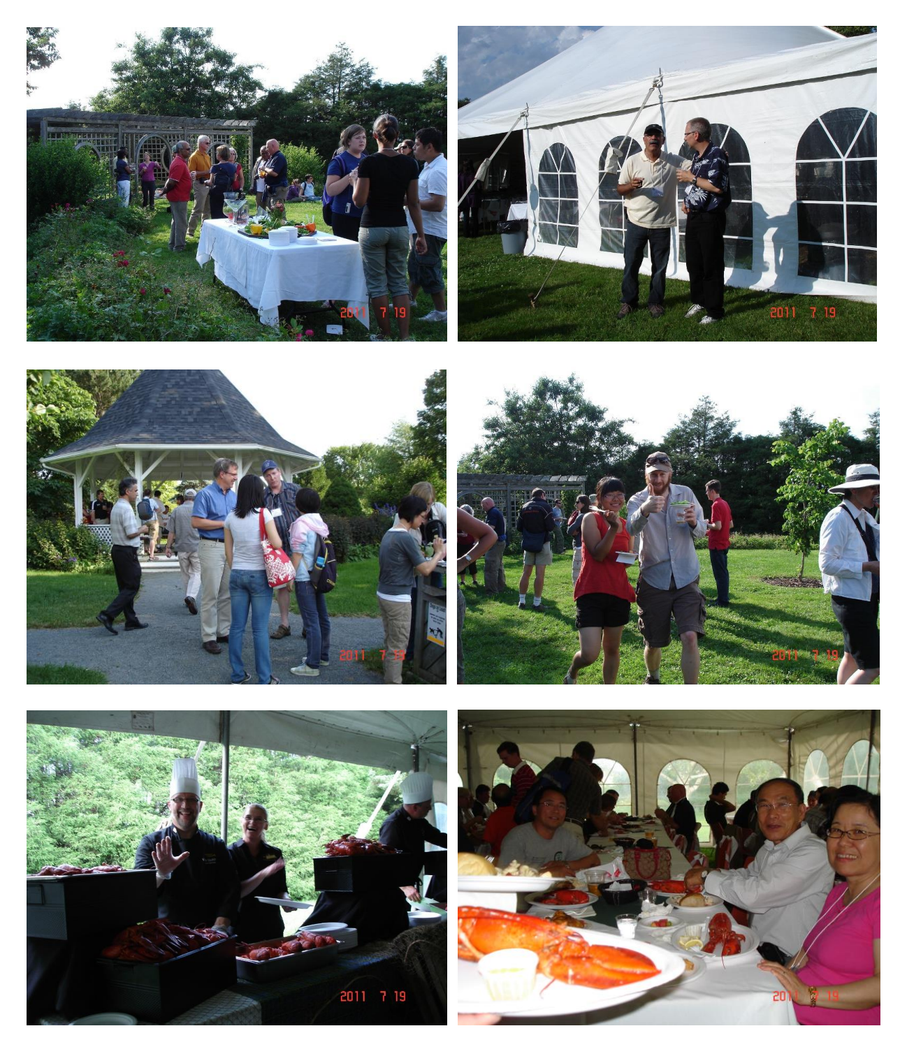
Beside the four tours on July 19<sup>th</sup>, there was a post conference tour of NSAC in the afternoon of July 21<sup>st</sup>. The awards were presented at the Conference banquet on Wednesday, July 20<sup>th</sup>.

of Nova Scotia were taking place that day between 8:30 am and 5:00 pm. All four tours ended at the lobster BBQ at Nova Scotia Agricultural College in Truro. The weather was cooperating, the site was inviting, so the mood among the crowd was cheerful. Below are few photos from the BBQ at NSAC.